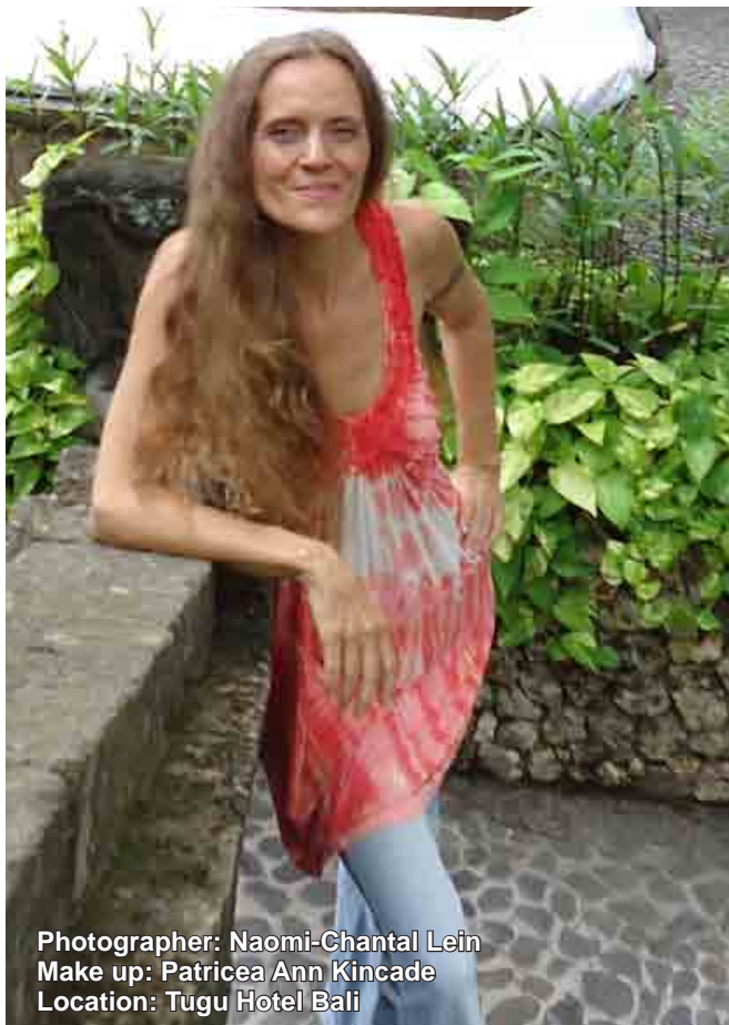
Make up: Patricea Ann Kincade Location: Tugu Hotel Bali